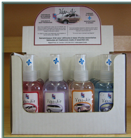
VEHICULES AIR FRESHENERS

« Turn your air haven of coolness through Vapo-Air . »